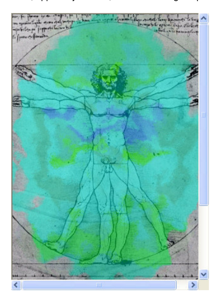
Male, appr. 45 years old, AFTER wearing the patches for appr. 4 hours